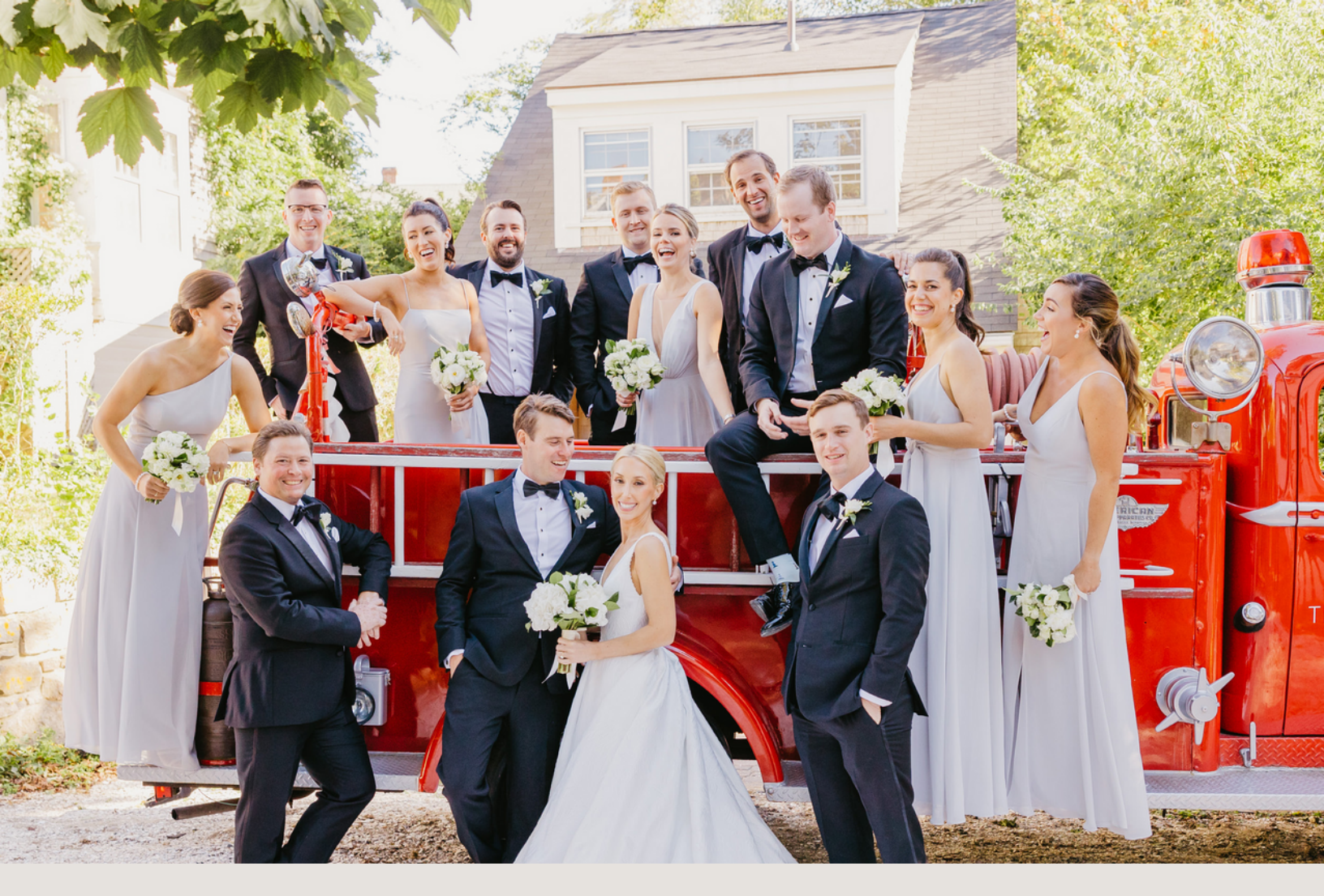
Ride in Style on our Antique Vehicles